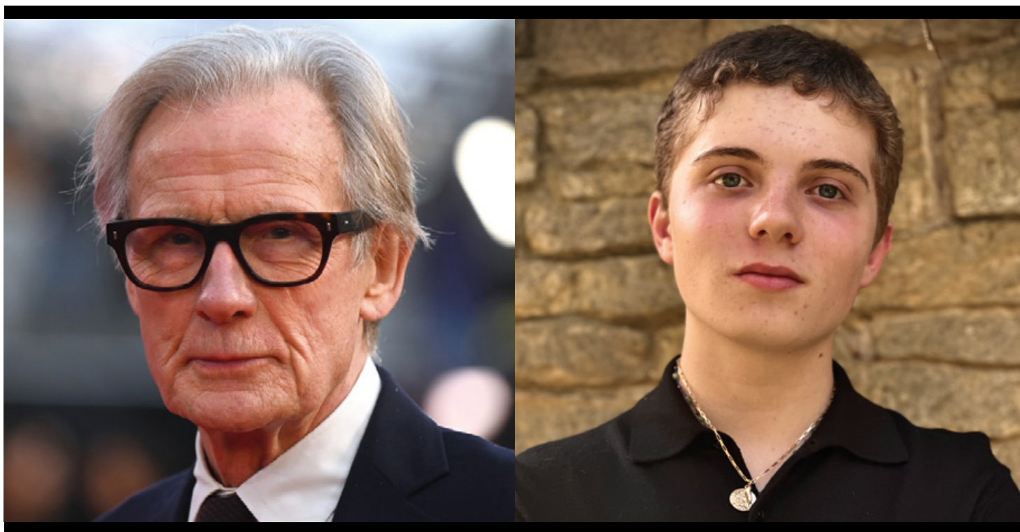
Picture given for guidance only. For internal use – not for distribution. Credits are not contractual.