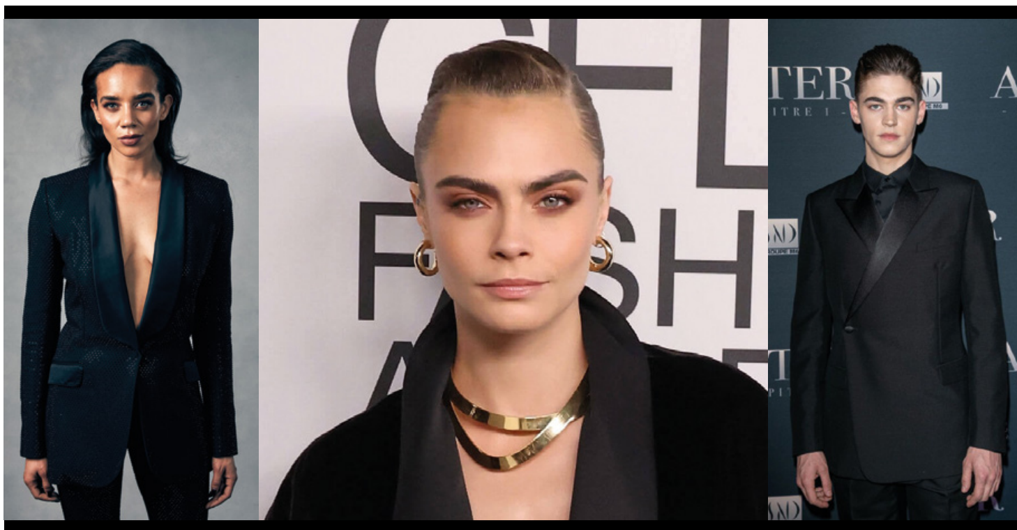
Picture given for guidance only. For internal use – not for distribution. Credits are not contractual.